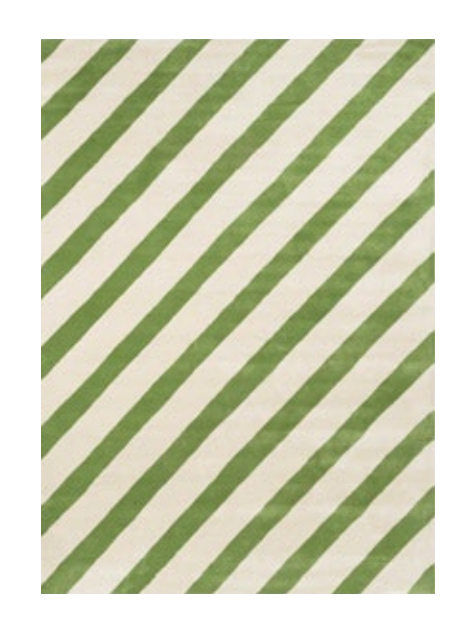
PAPER STRAW peridot |443|7