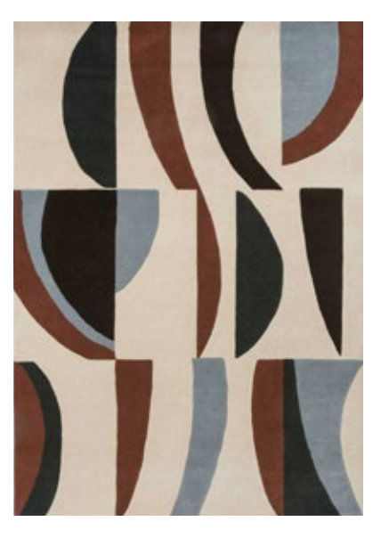
TORILLO cornflower/walnut 143905