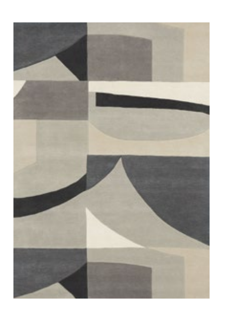
BODEGA stone 040504