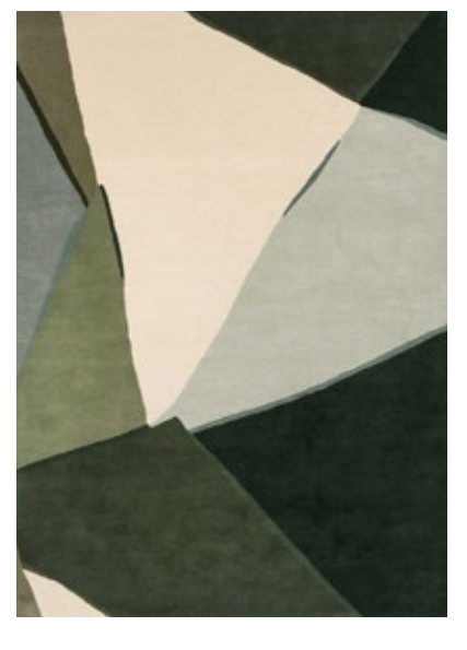
SUMI REFLECT cornflour/spice 143705