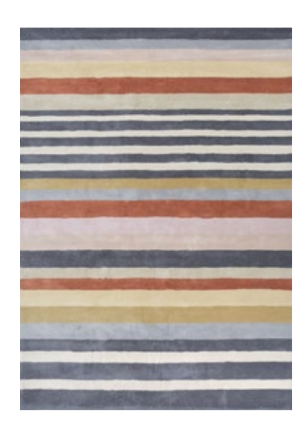
ROSITA harissa 140402