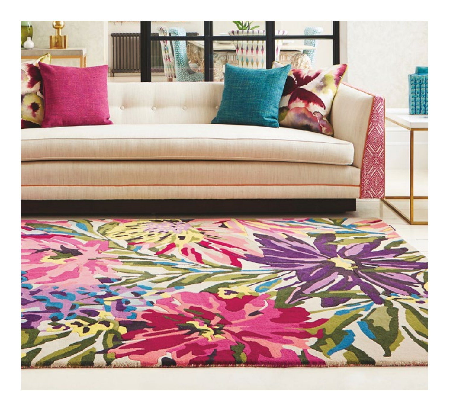
FLOREALE fuchsia 044905