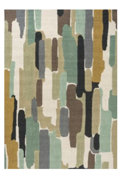
TRATTINO sea glass 444804