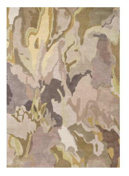
FORESTA pebble/sand 143511