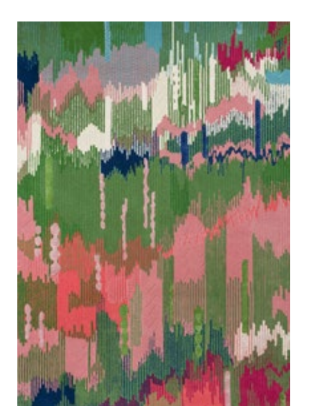
WILDERNESS peridot/emerald 144507