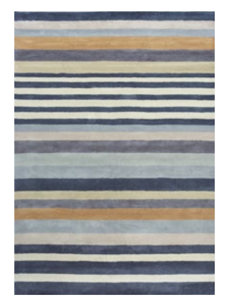
ROSITA putty |40404