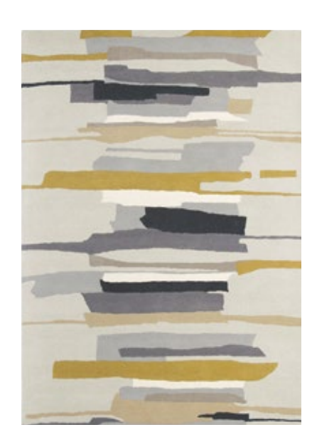
ZEAL pewter 043004