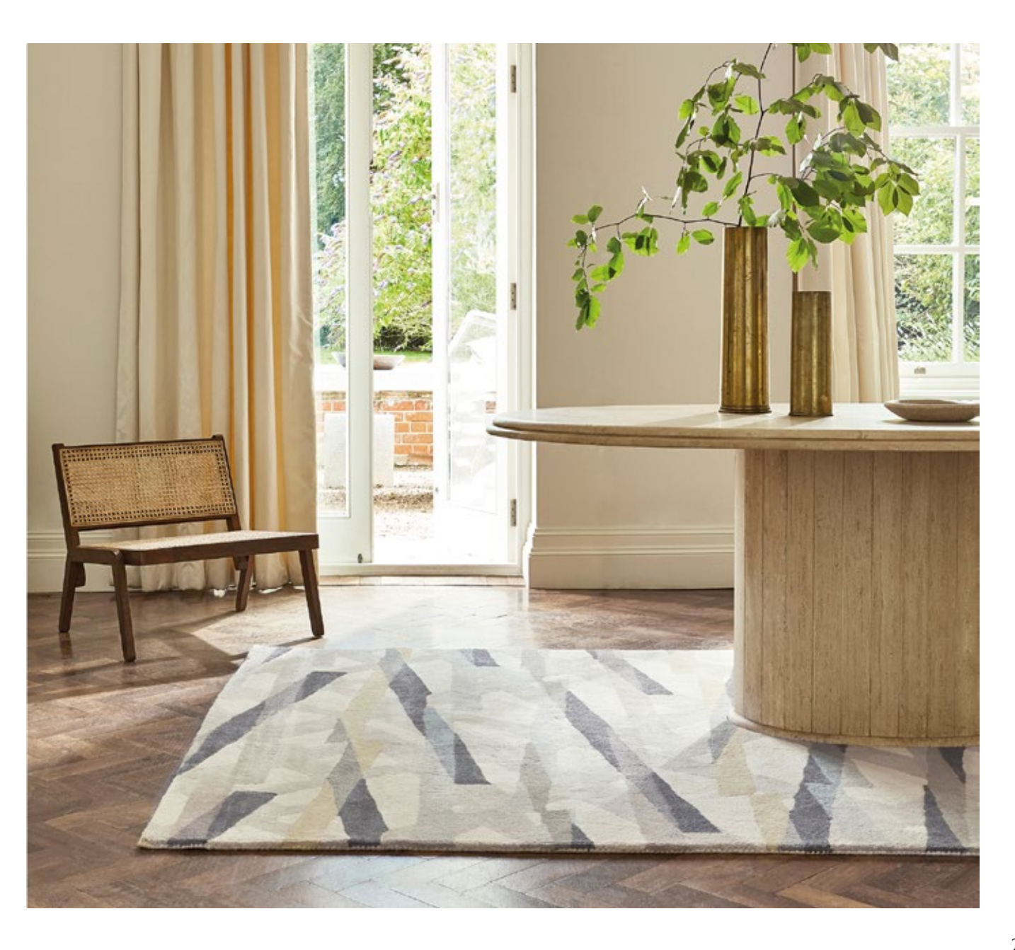
DIFFINITY topaz 140006